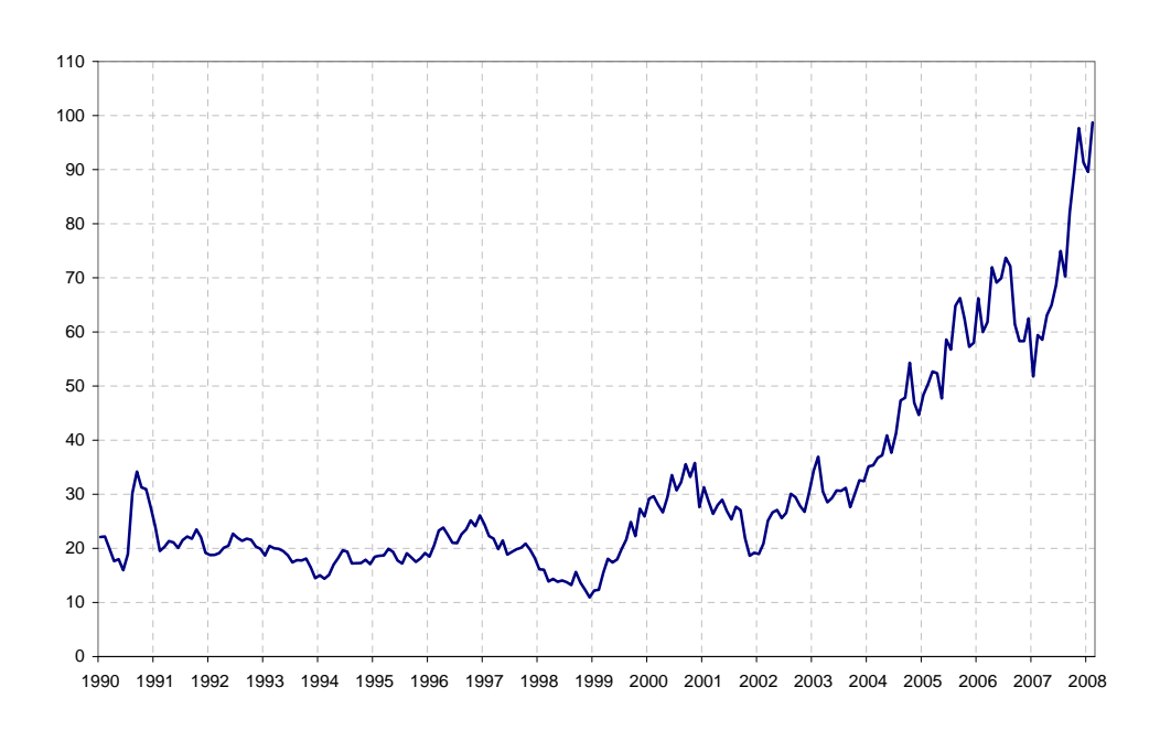
Figure 1: Oil price

Although the dependency of global economic activity on crude oil has fallen steadily over the last thirty years, the oil price baseline assumption remains an important variable for all macroeconomic forecasts. For example, forecast of future oil prices are crucial in central bank's monetary policy decisions, because they enter the construction of expected inflation and output-gap (Svensson, 2005). The increase in oil prices since mid-2003 (Figure 1), which has surprised most analysts by its rapidity and intensity, prompts a new call to investigate the validity of the forecasting assumptions.