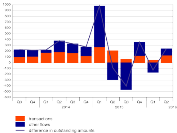
Chart 2: Transactions by type of investment fund

(quarterly changes in EUR billions; not seasonally adjusted)