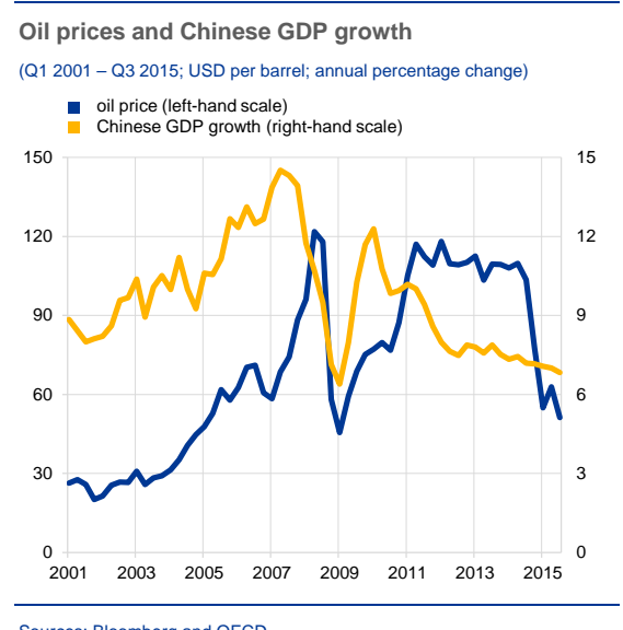
Chart B China has been an important driver of oil prices

Note: Oil prices are nominal Brent crude oil prices.