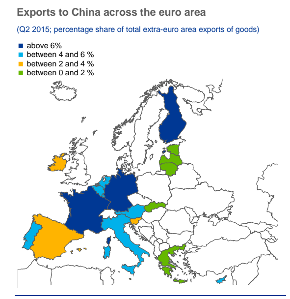
Chart A Trade linkages with China are limited