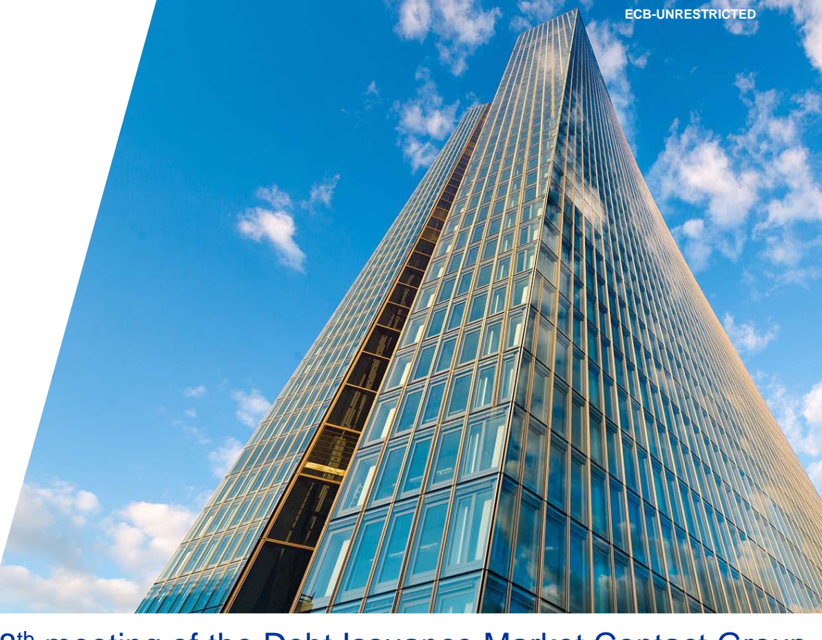
8<sup>th</sup> meeting of the Debt Issuance Market Contact Group 16 June 2021

Next steps for the drafting and review of the DIMCG report